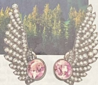
Wing earrings in red gold, silver, pink spinels and diamonds; Cambridge tiara ring in red gold, silver and diamonds