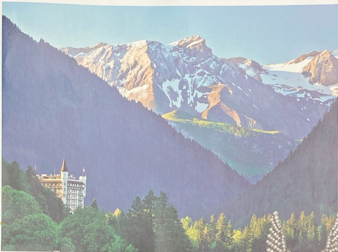
Tête à Tête ring in red gold, silver and diamonds; Pompom earrings in white gold, natural pearls and diamonds