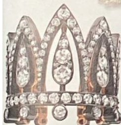
Couronne tiara ring in red gold, silver and diamonds